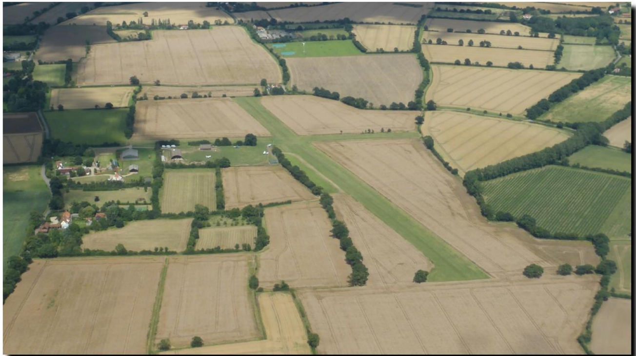
Monewden Airfield taken 27-July-2016